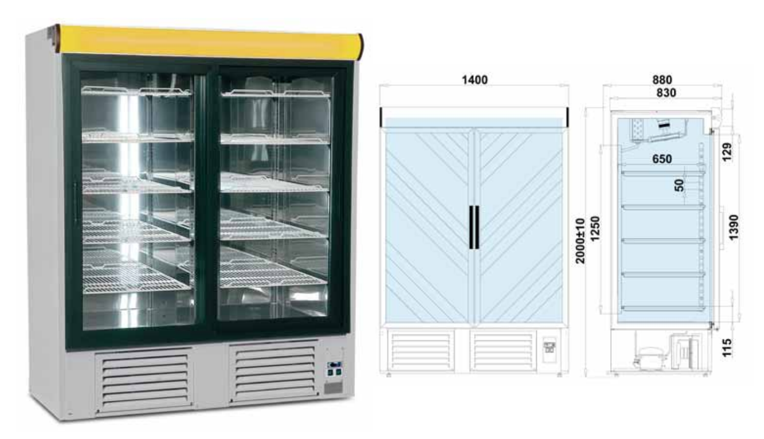
I-Ola 2 Gastro*